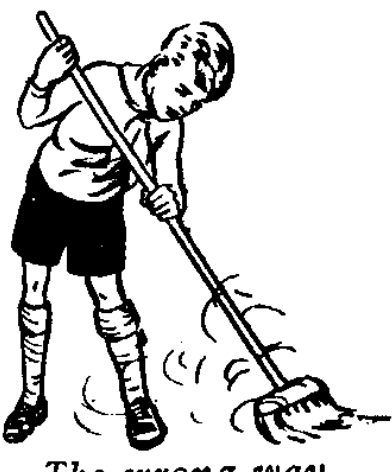
The wrong way.