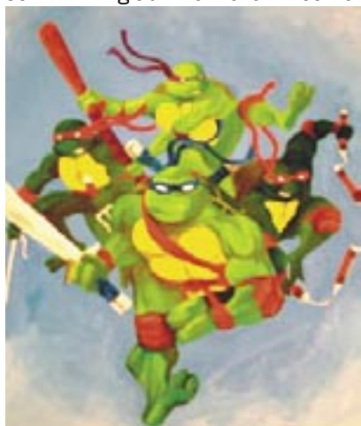
I'm glad I've never met her down a dark alley