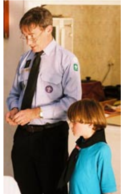
Our newest Beaver finds out what it means to be part of Leander