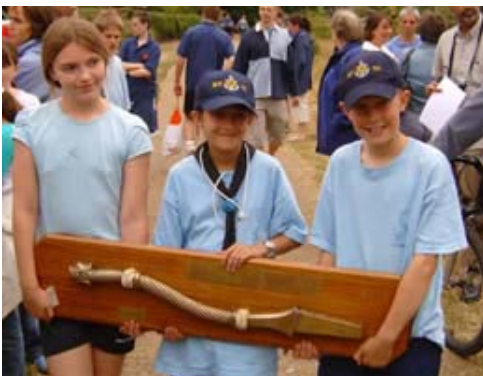
Winners of the under-12 double dinghy pulling at the Regatta. Holding the trophy is harder than rowing!