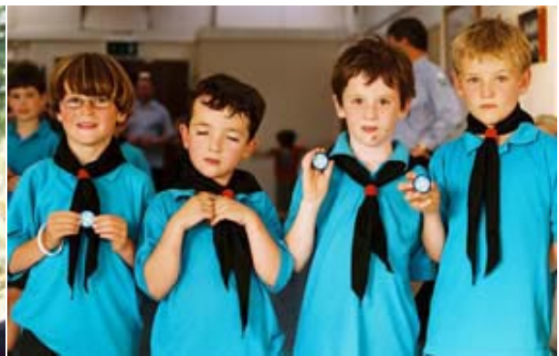
Four new swimming badges