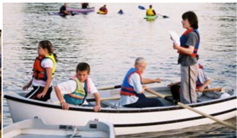
Coming alongside - but hands off the gunwhales!