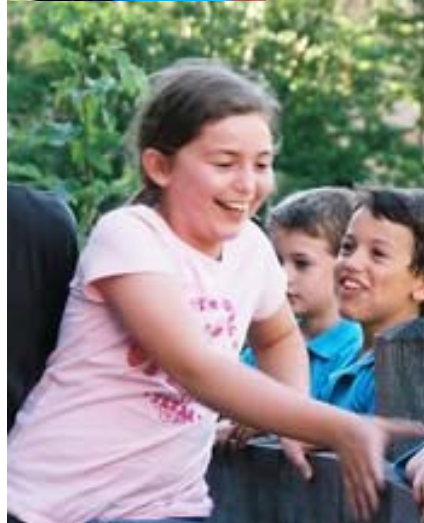
Beavers having a go on the uni-cycle – no wires, and you can't even see them being held up!