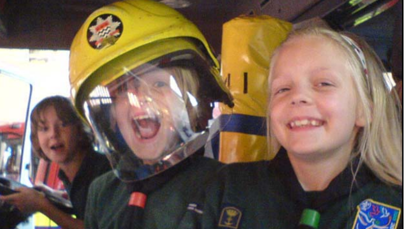
then we're off to find the fire ...