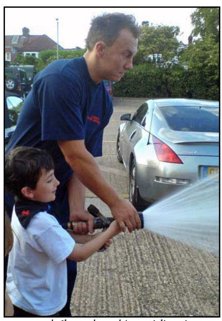
and give a hand to put it out. (Now, where are the Leaders??)